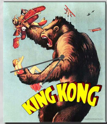
OILRKOKKC01 £8.25 (3) King Kong Wooden Empire State Clock