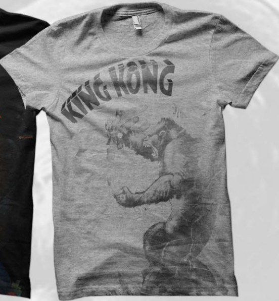
OILRKOKKTS03 £7.50 (6) King Kong Men's Black & White Empire T-Shirt