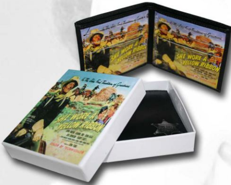
OILRKOJWW01 £5.50 (6) John Wayne She Wore a Yellow Ribbon Wallet