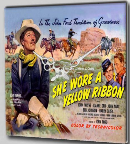
OILRKOJWC01 £8.25 (3) John Wayne She Wore a Yellow Ribbon Wall Clock