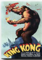
OILRKOKKM01 £0.90 (6) King Kong Empire State Magnet