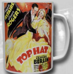
OILRKOFAFG03 £4.34 (6) Fred Astaire Top Hat Mug