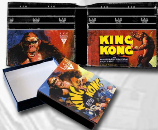
OILRKOKKW01 £5.95 (6) King Kong Leather Wallet in a Box