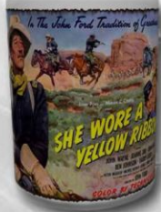
OILRKOJWMG01 £4.34 (6) John Wayne She Wore a Yellow Ribbon Mug