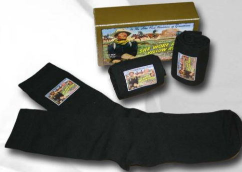
OILRKOJWS01 £7.00 (3) John Wayne She Wore a Yellow Ribbon Socks in a Box