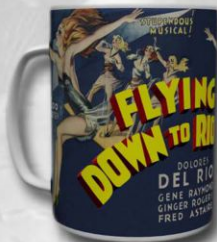
OILRKOFAFG01 £4.34 (6) Fred Astaire Flying Down to Rio Mug