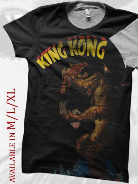
OILRKOKKTS02 £7.50 (6) King Kong Men's Coloured Empire T-Shirt