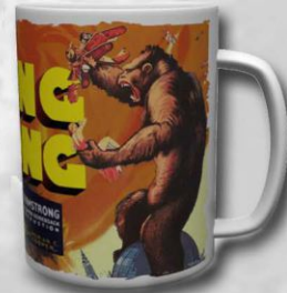
OILRKOKKMG01 £4.34 (6) King Kong Original Film Poster Mug