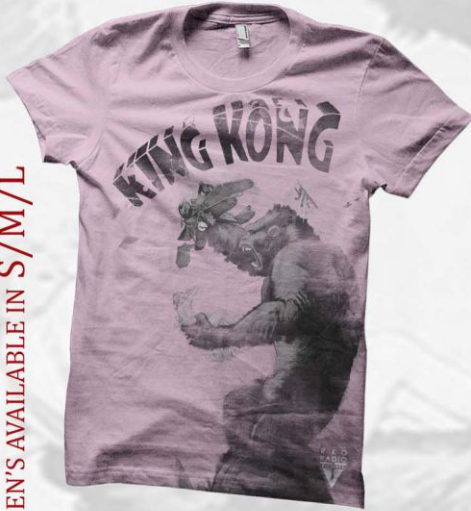
OILRKOKKTS01 £7.50 (6) King Kong Ladies Pink Empire T-Shirt