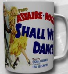
OILRKOFAFG02 £4.34 (6) Fred Astaire Shall We Dance Mug