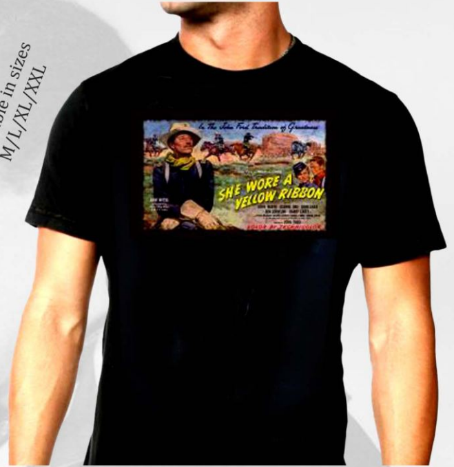
OILRKOJW01 £7.50 (3) John Wayne She Wore a Yellow Ribbon T-Shirt