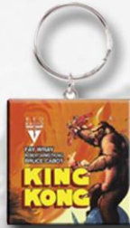
OILRKOKKK01 £1.45 (6) King Kong Empire State Keyring